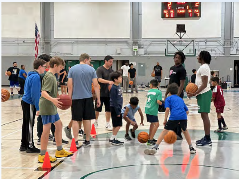
DVC's Men's Basketball players with e-hoops participants

This event supported children to foster teamwork, friendship, and a love of basketball. Along with volunteers from the community, international students, and DVC’s basketball team, children participated in group warm-up activities, basketball drills and fun relay races, and also had an opportunity to interact with DVC’s basketball team.